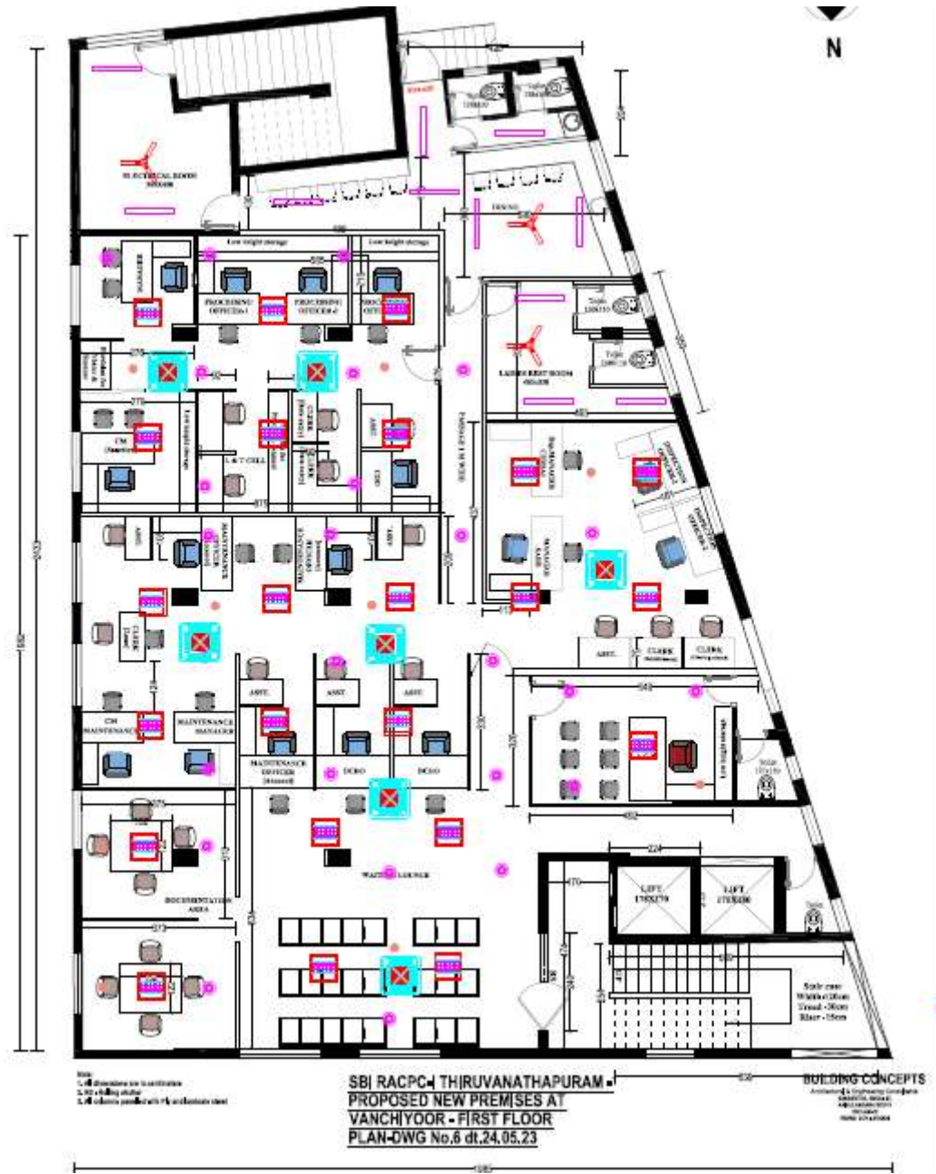
LAYOUT WITH ELECTRICAL FITTINGS & AC- First Floor